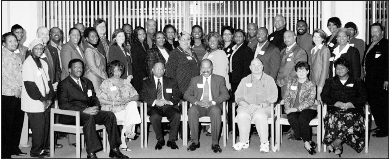
Joint Board Advisory Council 2005

The Consortium of African American Organizations (CAAO) was originally formed in 1993 as the African American Business Consortium. The name was changed in 2001 when formal nonprofit status was sought and obtained to better reflect the mission. CAAO's mission is to utilize the resources of Northeast Ohio African American professional